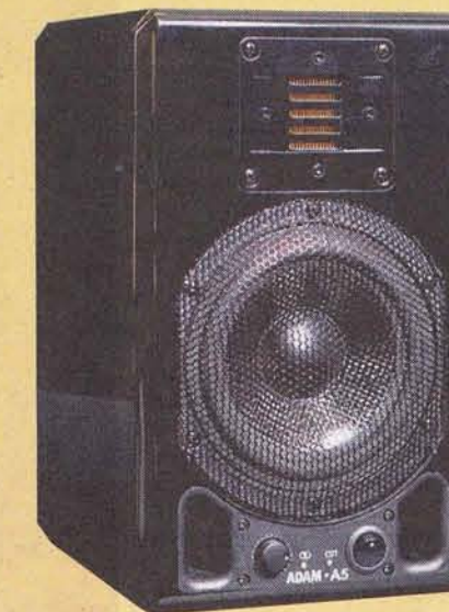
BEST FOR CLASSICAL ADAM AUDIO A5 £399

Unusual "ribbon-design" treble units make the A5s well suited to classical music, with a delicacy that communicates the atmosphere and scale of a full orchestra. The large bass units integrate well, giving a natural feel with great impact — thanks to a fine 25W amplifier that doesn't distort even on the crescendos. The result is a big sound from medium-sized (11in high) speakers. The utilitarian styling won't be for everyone, however.