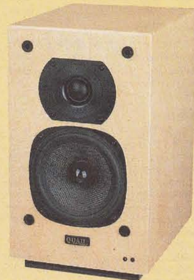
BEST FOR JAZZ AND BLUES QUAD 11L-A ACTIVE £599